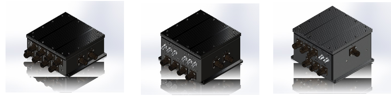
ETN-MS8 (8 port managed switch)

As part of Eon's Video Distribution Architecture a series of ethernet managed switch, video distribution and encoder units are now available. These products range from 8 port 10/100/1000 Mbps managed switches to switches that include NTSC splitters and encoders that convert NTSC to H.264/265 and MPEG2 formats for ethernet distribution. All units include redundant 16 to 40 vdc power inputs for failsafe operation. Like all other Eon products these units can be customized for different connectors, power inputs and video processing. All ethernet products are fully qualified to Environmental and EMI MilSpec DO-160, 461, 704, and 810.