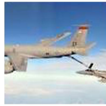
Aerial Refuelling Amplifer Unit

About Eon Instrumentation --- Since 1961 Eon was founded in 1961. Eon is a veteran owned multi-million-dollar business that includes three development subsidiaries for design/manufacture of military qualified, rugged industrial, and commercial products for airborne, shipborne, ground vehicle platforms, plus homeland security and flight test applications. Eon's customers include direct contracts with all US Military Departments, International and US Primes, Ranges and Commercial/Industrial Programs.